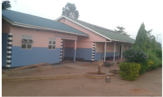
St. Nektarios Health Center