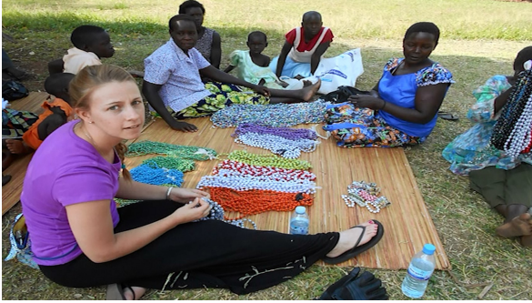
Mother's Union Bead Making

Lift Up Uganda Inc. was founded in 2015 with the goal of helping people of northern Uganda through improving EDUCATION and HEALTH CARE . People of all ages can benefit by promoting education to encourage self-sufficiency. Improving health through education for health promotion, illness prevention, and provision of direct health services allows for healthier people to help their families and communities thrive.