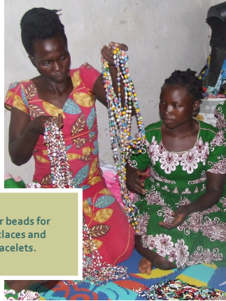
Paper beads for necklaces and bracelets.

The Mothers goal is to send as many boys and girls to school as possible.