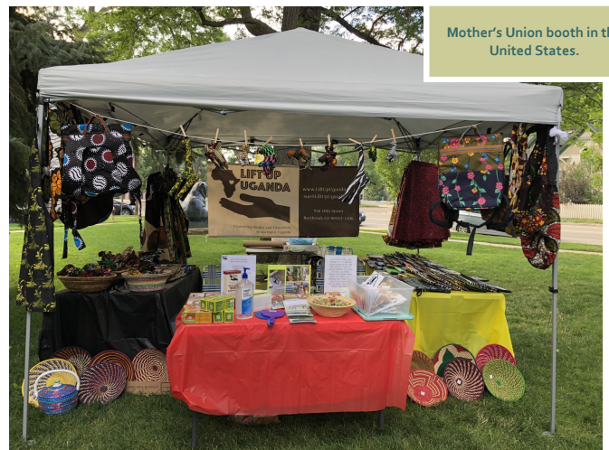
Mother's Union booth in the United States.