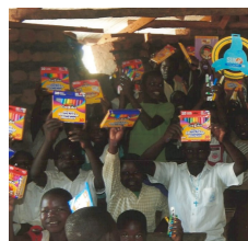
Children at St. Anthony the Great Receive School Supplies.

School supplies are regularly provided for both students and teachers. If you are interested in donating selected supplies, please refer to our Wish List on Amazon . All donations are greatly appreciated.