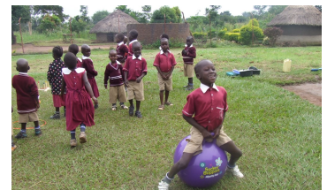
Parents know that education is a means to a better future for their children, families, and the entire community.

In 2020, additional classrooms were added for children in primary grades 1 and 2. In the future, LUU intends to add additional classrooms for primary grades 3 through 6.