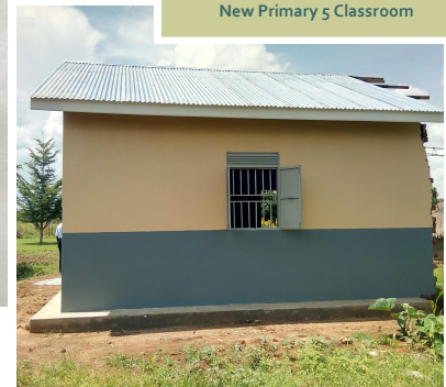
New Primary 5 Classroom