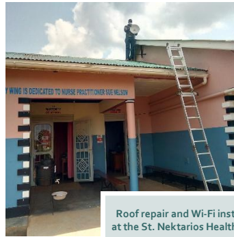
Roof repair and Wi-Fi installation at the St. Nektarios Health Center.

While on our June Mission, there was a violent thunderstorm in Gulu. During the night, lightning struck the roof of the St. Nektarios Health Center which severely damaged the solar power system. Despite the lightning arrestor decreasing the severity of the strike, immediate repair was needed. Strict COVID lockdowns delayed the needed parts coming from Kampala. For five weeks there was no light, no computer, no telephone, and no working microscope for this 24-hour Health Center. The Midwives delivered babies by flashlight and kerosene lanterns until repairs were made and power was restored. Then long-awaited Wi-Fi was installed to assist the Doctors and Midwives for consultation and continuing education.